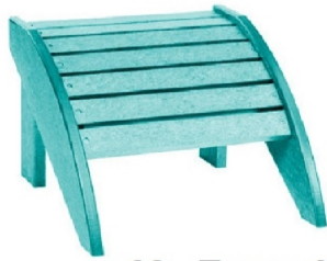
09 - Turquoise