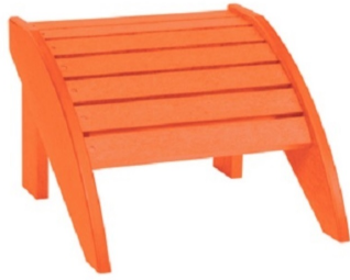
13 - Orange